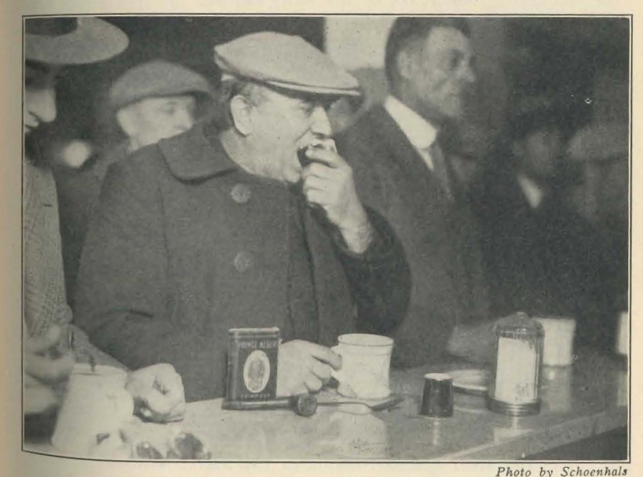
BREAKING A FORCED TWENTY-FOUR-HOUR FAST

It may be an item of interest to note that the cashier rejoices