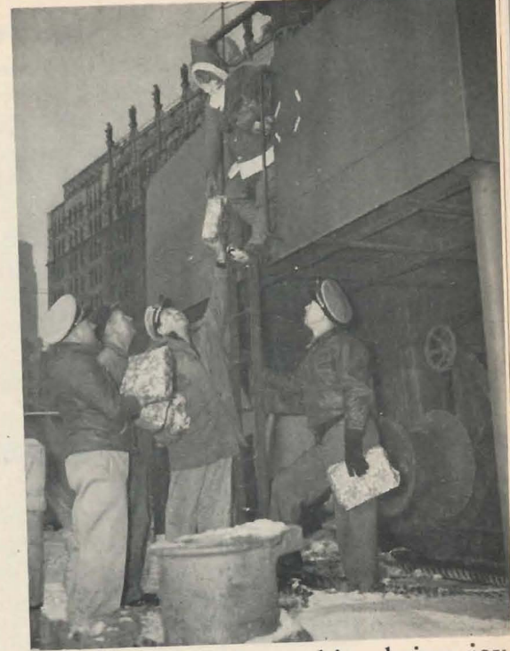
Gifts placed on ships bring joy at sea on Christmas Day.

Christmas time, when dreams should be of home, family and loved ones, is often the darkest, most lonely period for seamen. To prepare for this, as early as November 15th, Christmas boxes were being placed aboard ships that were sailing and would be at sea on Christmas day. On ship-board, ill in hospitals, or at the Institute during the holidays, over 5,000 seamen received Christmas packages through the year-long efforts of the volunteers of the Central Council. It was indeed heartening to read the letters of appreciation that poured in from these men. To many, the packages from the Institute were the first they had received in years.