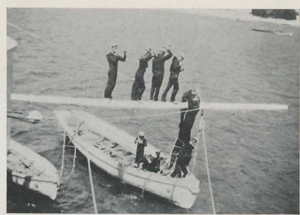
"General Bottra", in Capetown, South Africa LIFEBOAT DRILL Aboard a Training Ship