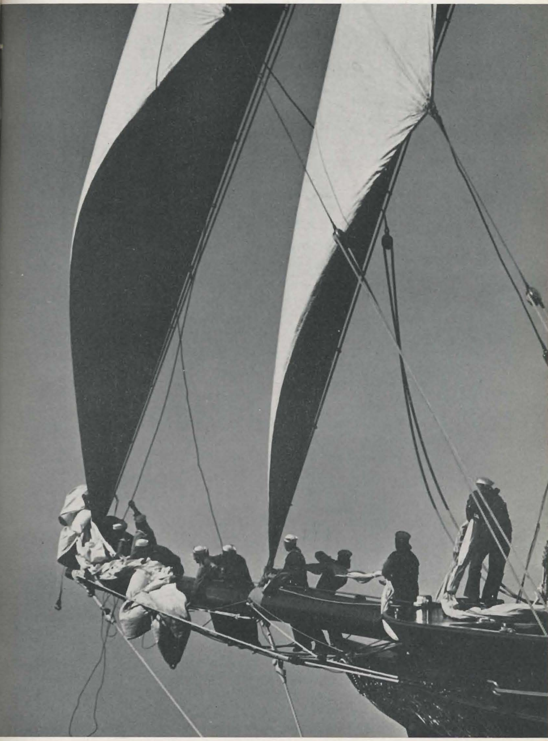
SEAMEN'S CHURCH INSTITUTE OF NEW YORK