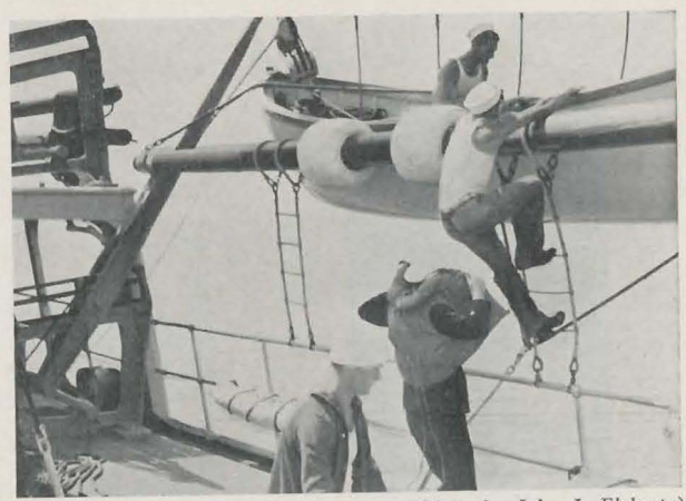
Reprinted from "Guardsmen of the Coast".

LIFEBOAT DRILL Aboard a U. S. Coast Guard Vessel