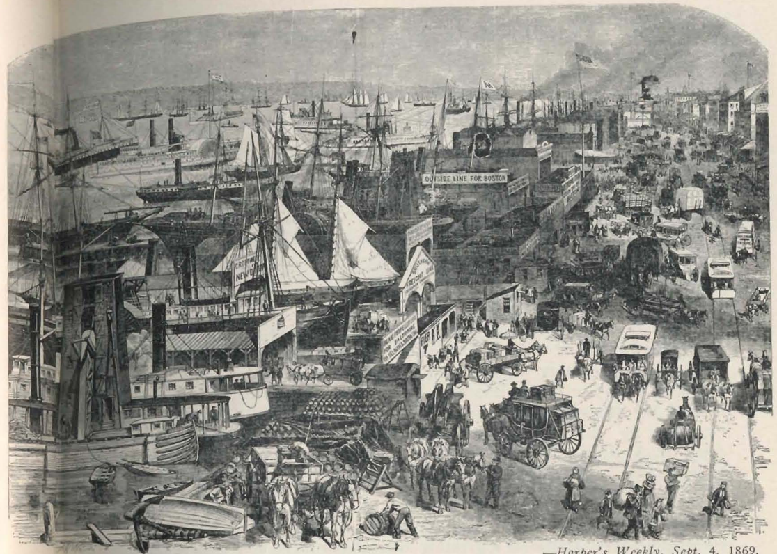
—Harper's Weekly, Sept. 4, 1869.

Can't you just imagine, from this vivid word picture, those sailor boys enjoying the comforts of a real home after long months at sea? What Carie did for these men in that isolated