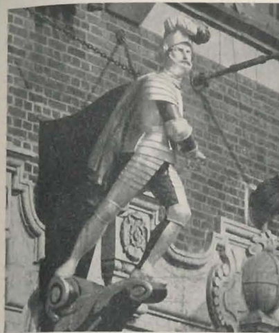
Figurehead of "Sir Galahad"