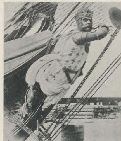
Figurehead of "The Black Prince"

bers of England is dead. Marine and armor experts have all searched thoroughly but in vain for a clue.