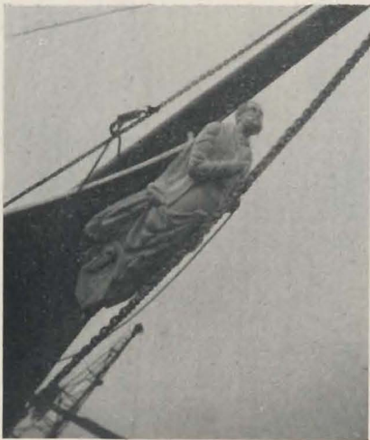
Figurehead of "President Garfield"