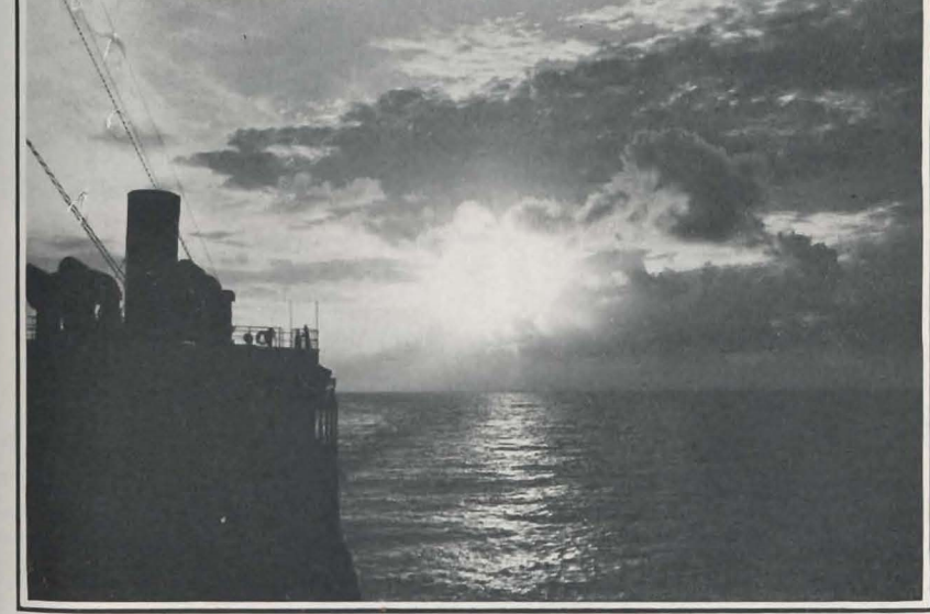
THIRD PRIZE — "Sunset, in the Gulf, Down Mexico Way"