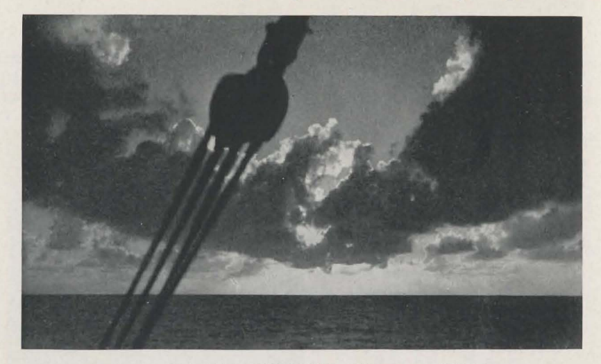
No. I. THE LULL BEFORE THE STORM: AT SUNSET.

The day had been warm and sultry. The sky was overcast. Bunches of rain clouds hung overhead with their dark centers and white rims. There was a calm sea, smooth as glass. This is known to all seamen as "the lull before the storm." The clouds gathered toward evening, and the sea was broken into ripples. The horizon was a misty gray. A storm was coming.