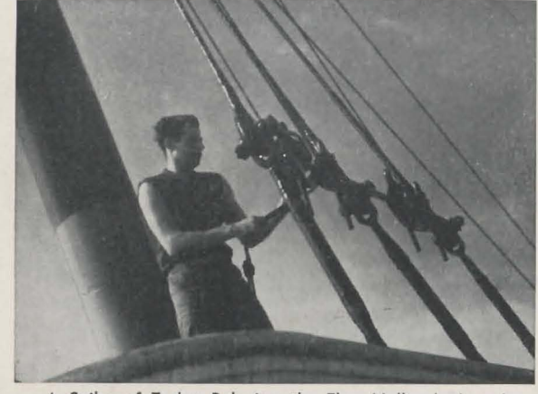
A Sailor of Today Belaying the Flag Halliard aboard the S.S. New York of the Eastern Steamship Company.

"The sea is not safe! Passage at sea, at this very moment, is as hazardous an adventure as at any time since the Phoenicians trimmed their sails and manned their oars on the first great trading and exploring voyages. Hazards have increased ten thousand fold with the vast increase in size, speed, and number of ships afloat. Fog is as thick as when the world began, seas:"