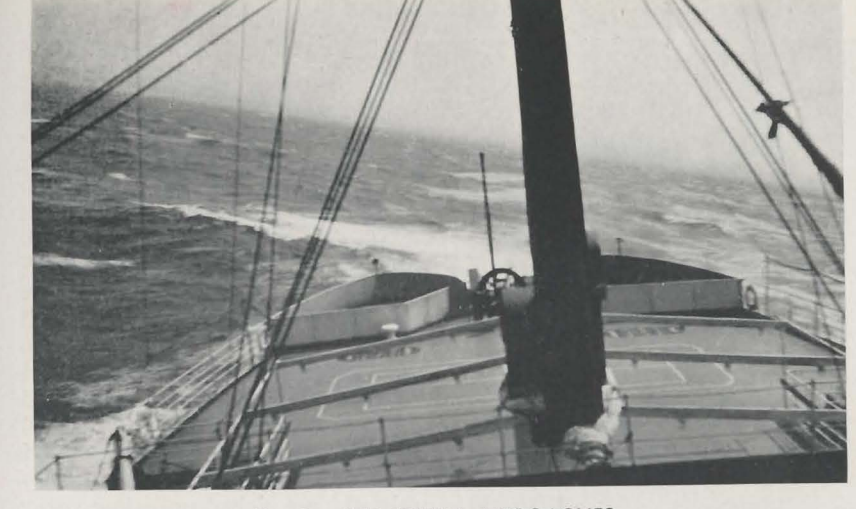
No. 3. THE STORM APPROACHES: The sea began to swell and a strong wind came up. The storm was dead ahead. This stern view of the ship shows her as she pitches and rolled in a "following sea", the waves following the ship.