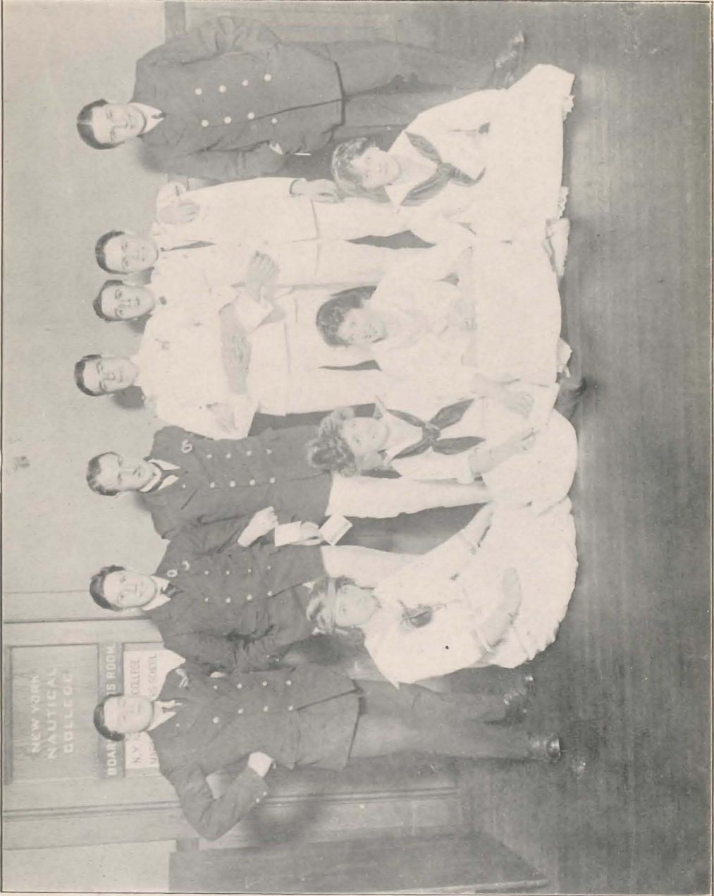
SEVEN APPRENTICE LADS