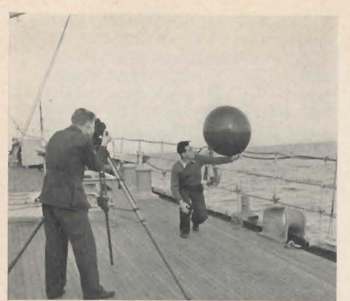
For surface observations a smaller balloon is launched, the flight of which is watched through the theodolite, an instrument which measures the direction and the angular altitude. This balloon disappears in the clouds and is lost to view, but the ceiling is determined and the data up to the ceiling is of value.

to perform peace-time duties of a humanitarian nature such as the transportation of persons needing medical attention from ships to hospitals; the warning of small boats and fishing craft of approaching storms; the searching for overdue or lost vessels; the survey and rescue work in connection with floods, hurricanes, etc.