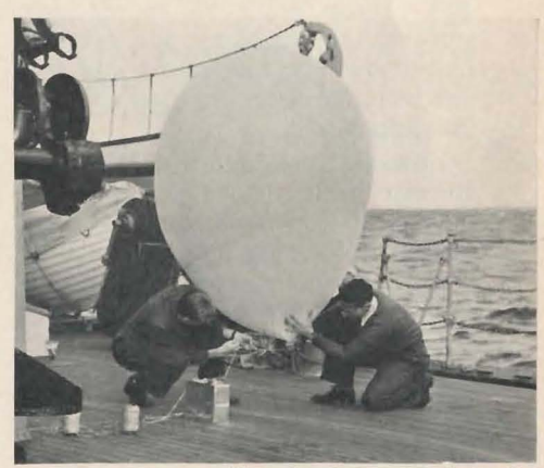
U. S. Coast Guard Cutter "Pontchartrain"

It is not surprising that the U. S. Coast Guard, the oldest maritime service of the U. S. Government (on August 4th, 1940, it marked its 150th anniversary) was selected to establish this unique weather service. Each year the Coast Guard takes on new duties: it inaugurated the Ice Patrol; during prohibition it had the thankless job of rum running; in more recent years it has investigated the narcotics and explosives trades; last year it took