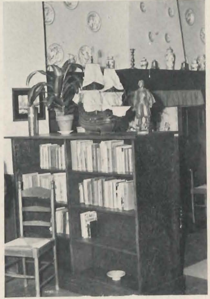
A cozy corner of the new Home for Netherland Seamen showing a model of Henry Hudson's ship "The Half Moon" and a replica of Karl Gruppe's statue of the famous mariner, the original of which adorns the entrance to the Henry Hudson Highway in New York City.

land Shipping and Trading Committee decided to set up a room here in New York where they may enjoy companionship, read Dutch newspapers, magazines and books, eat Dutch cakes and drink Dutch coffee while they are on shore leave. The Committee asked for a room in the Institute, thus at the same time making available to the seamen the superb facilities of the large building including the lodging accommodations, restaurant, cafeteria, baggage room, barber and