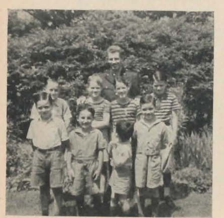
Boys from Curtis House, Meriden, Conn. Sent Christmas Boxes to the Institute.

"Hi, sailor: I hope you like the comfort bag. You see, I'm the gal who got the girls in our class going on the idea but before I knew it, the boys wiggled their way into it too. If you ever get time to write me a list of sailors slang and then