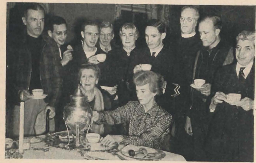
Volunteers entertain in the Seamen's Lounge