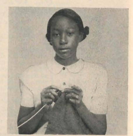
Volunteers of St. Phillip's Auxiliary knit many sweaters for Merchant Seamen

qualified to serve. A set of Rules for Volunteers must also be read, and the volunteer must agree to abide by the same regulations to which the regular employees of the Institute adhere — promptness, reliability in keeping schedules, and keeping thoroughly informed on all Institute programs and referring to the proper Department Managers questions of policy and procedures.