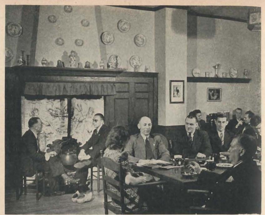
Dutch hostesses entertain seamen in the Netherlands Room on the third floor of the Institute.