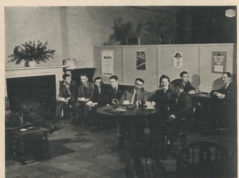
Young women volunteers serve tea to seamen in the British Merchant Navy Club on the second floor of the Institute.