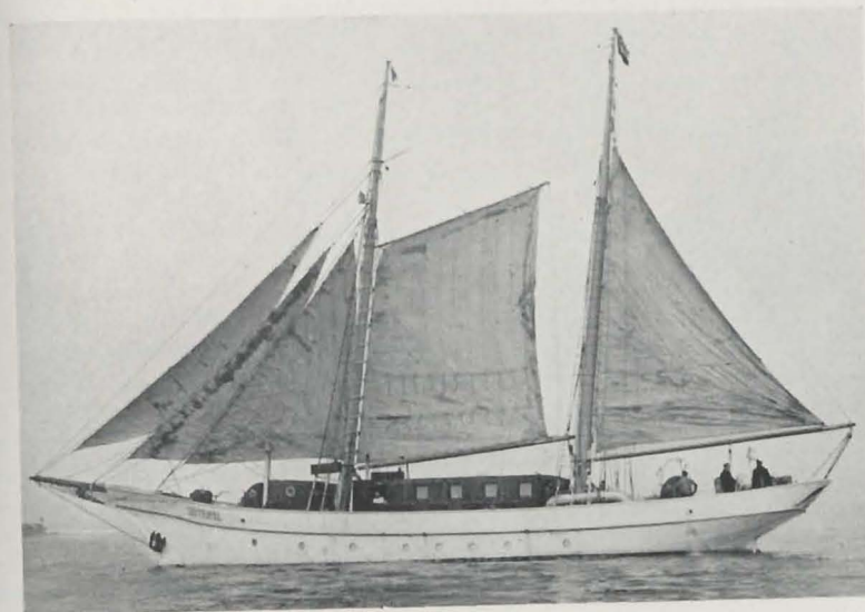
Count Luckner's new yacht, "Seeteufel".