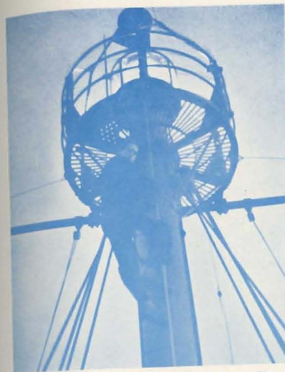
The Beacon, Nantucket Lightship