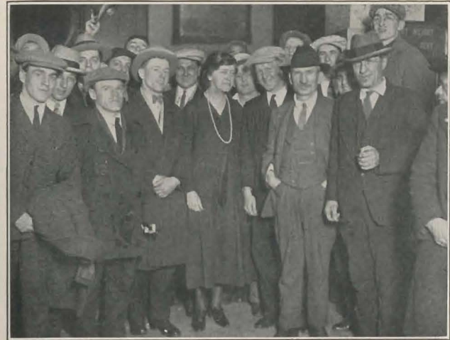
THE HOUSE MOTHER AND HER BOYS