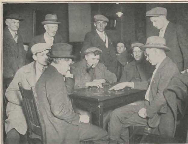
YARNS AND A GAME

"I hates the noise of the wind like I'd hates poison," he explains. "Board ship I sleeps with the wind in me ears. Ashore I wants quiet and a lee room. It's