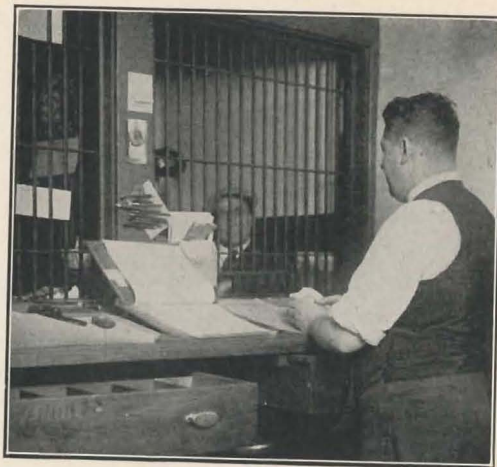
THE "BANK" WINDOW