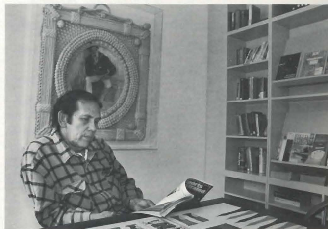
The Seafarers' Clubs at SCI are popular places for reading, recreation and relaxation.