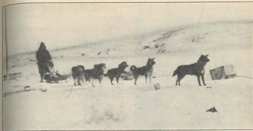
ACROSS THE ARCTIC WASTES

He is forty-nine years old but he does not look a day over twenty-five, so rugged an outdoor life has he led. He has guided expeditions to the North Pole, and has won a prize for climbing Mt. McKinley. When