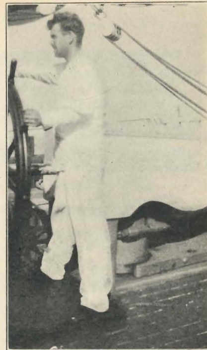
"I GRABBED THE WHEEL"

"Never was there such a wind or sea! The 'August Leonhardt' rocked like a frail canoe. The whole night long and all next day the storm raged and blew us off our course. At last the winds grew tired and the waves died down. Somehow the 'August Leonhardt' had weathered the storm and under her master's guiding hand she found her course again, while we, the crew of the little 'Wellington' groped on her deck,