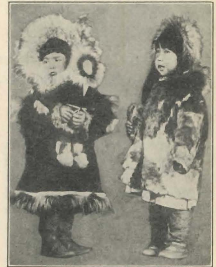
HIS TWO PAPOOSES