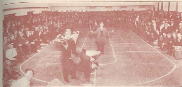
One thousand sailors nightly enjoy the entertainments in the Auditorium

In asking you to invest your dollars in a Red Letter Day to commemorate some loved relative or friend, we are confident that you will enjoy rich dividends from this humane enterprise.