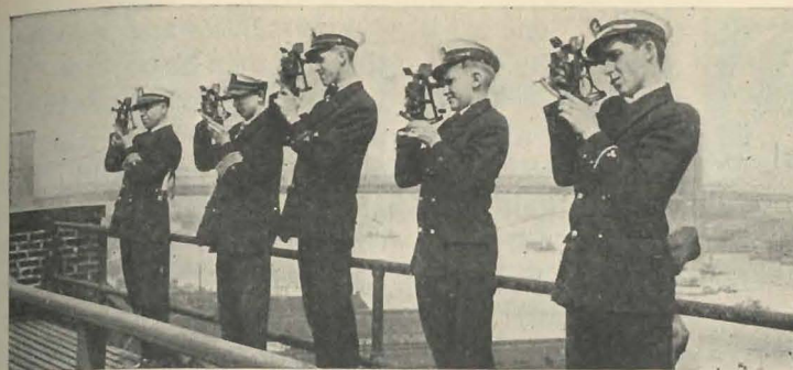
Cadets Learning to "Shoot the Sun."