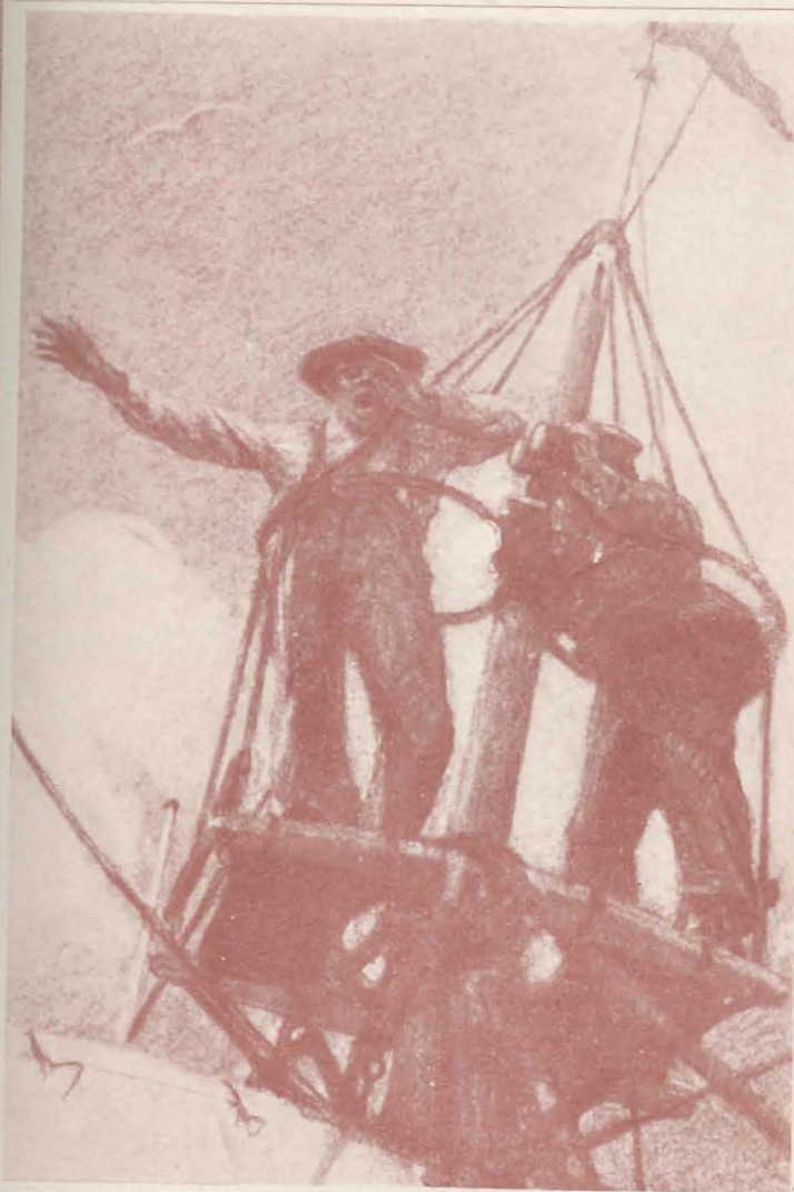
"There She Blows!"