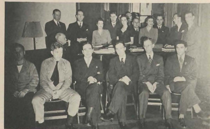
Blue Hill Troupe and seamen sing favorite songs from Gilbert and Sullivan operettas.