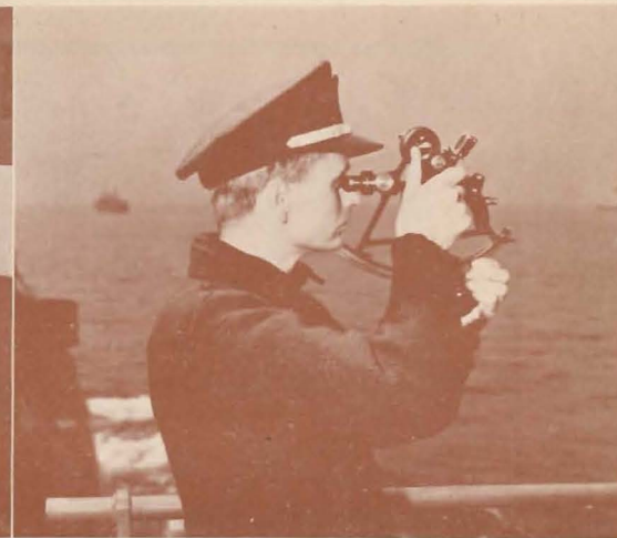
Using the sextant to determine ship's position.