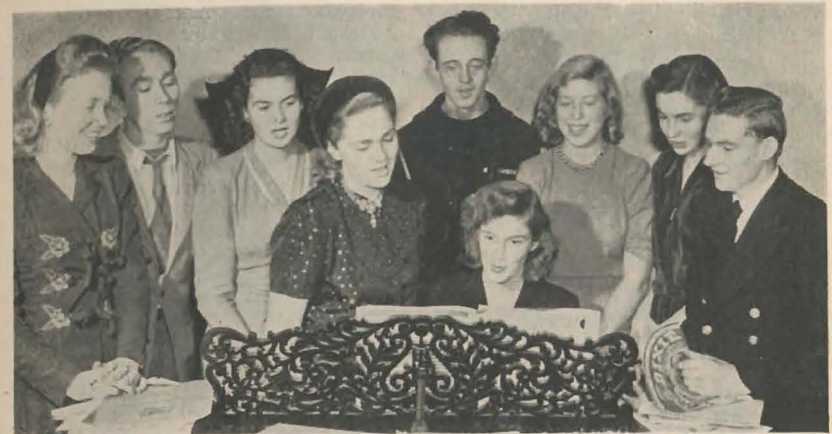
Debutante Committee joins with seamen in singing current popular songs.

3 East 67th Street, maintained by the Institute.