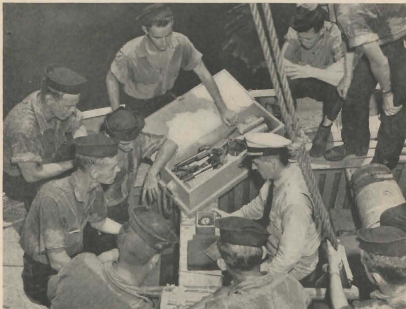
U. S. Maritime Service Training Station, St. Petersburg, Florida