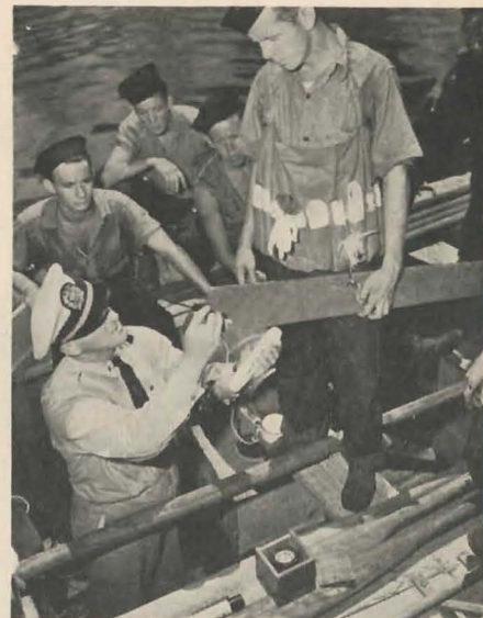
U. S. Maritime Service Training Station St. Petersburg, Florida