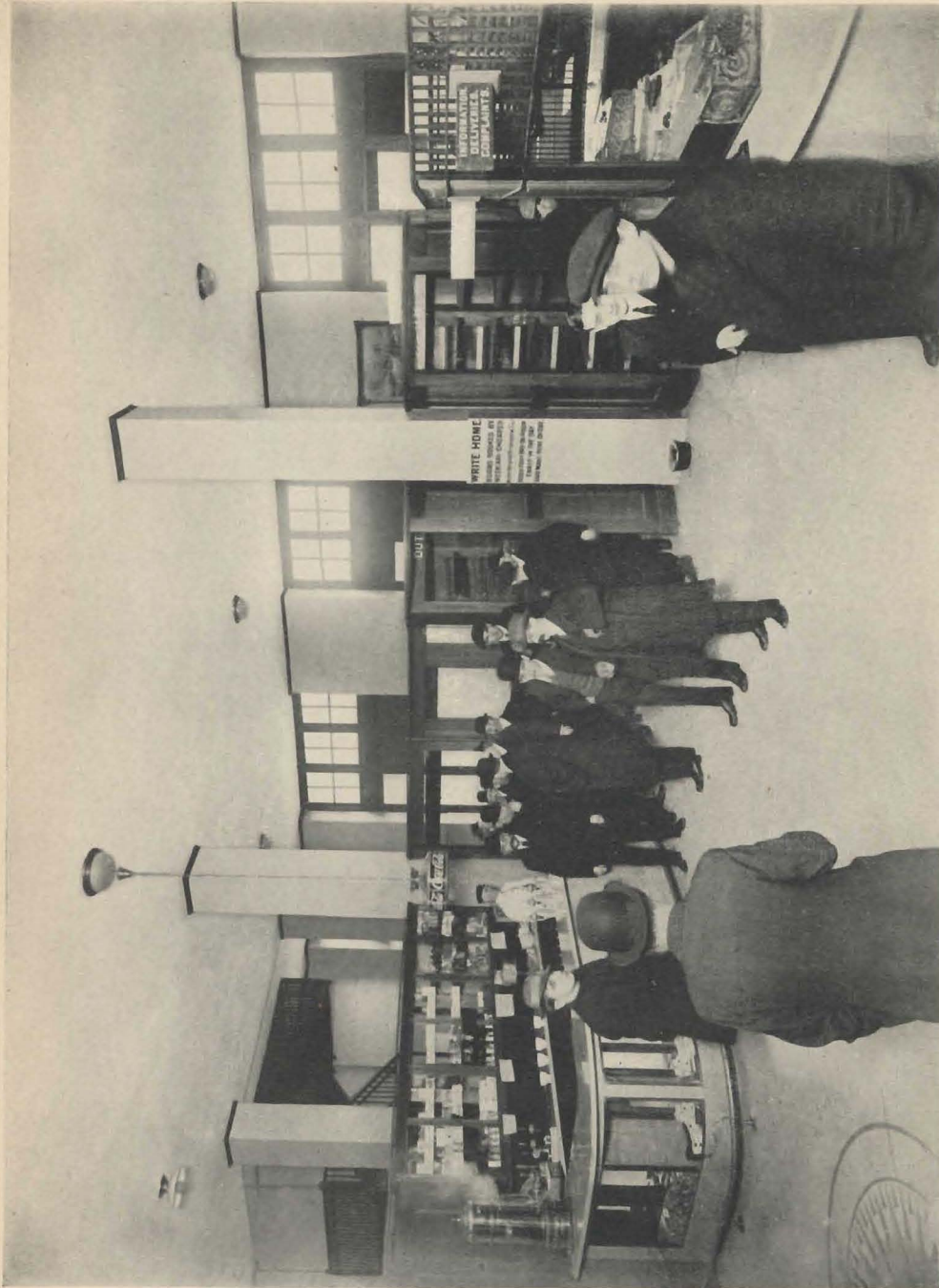
SODA FOUNTAIN, (Has not been given) Soft drinks bar with brass foot-rail.