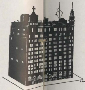
A Night View of the Seamen's Church Institute of New York