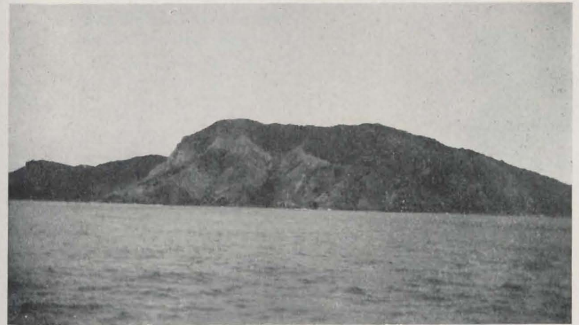
Pitcairn Island — 2 miles wide, 1 mile across. 165 Inhabitants. Nearest mainland, 3200 miles away: Auckland, New Zealand.