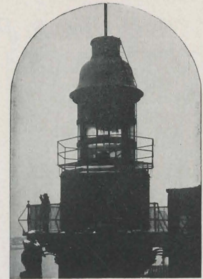
Titanic Lighthouse Atop Seamen's Church Institute of New York

One hundred and ten years ago a French physicist, Augustin Fresnel, died without realizing the important contribution he had made to lighthouse engineering. His "Fresnel" lens replaced the earlier reflectors, thereby increasing the candlepower of lights many fold, by reflecting and refracting the light. Acetylene gas was first used for lighthouse purposes in the United States in 1902. The first installation of electric light took place in England in 1858 at the South Foreland light. By 1878 several of the important lighthouses in the United States were illuminated by kerosene oil, burned in wick lamps. Later vaporized kerosene, known as incandescent oil vapor was used. Electricity is now used at many, such as Navesink, and in England there are four important electric coast lights and one, Isle of May, in Scotland, St. Catherine's in the Isle of Wight, and the Lizard, are the most powerful. Untended minor lights are illuminated by gas, stored in tanks or by