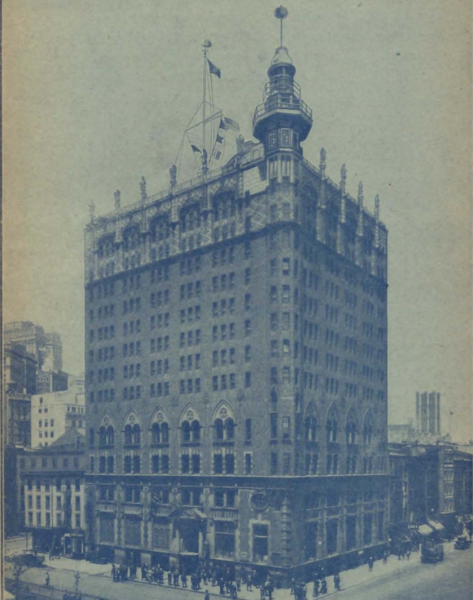
SEAMEN'S CHURCH INSTITUTE OF NEW YORK 25 SOUTH STREET