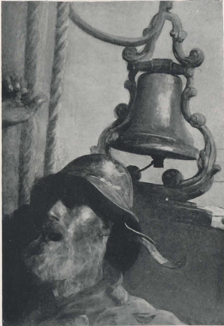
The Lookout: "All's Well!"

From the painting by Winslow Homer