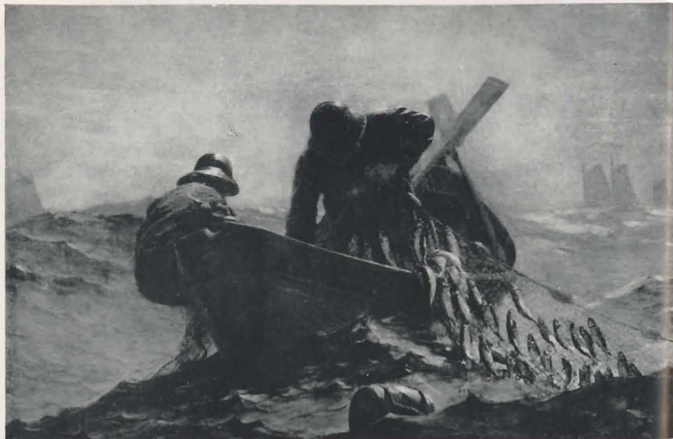
"The Herring Net"