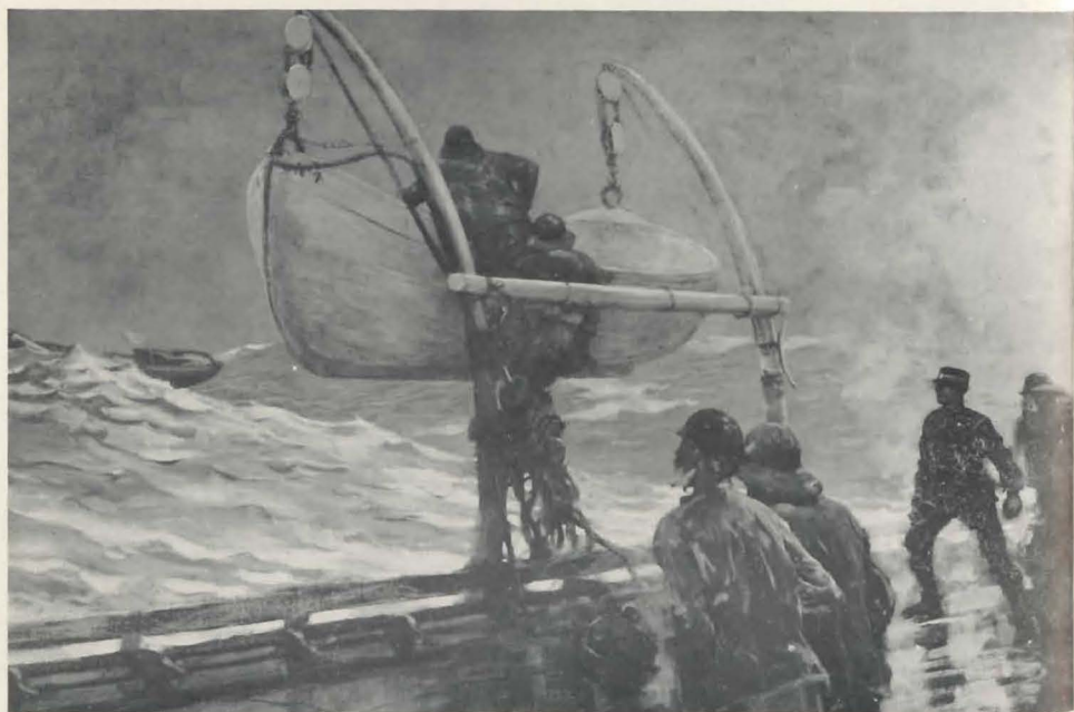
"The Signal of Distress"

Address all communications to SEAMEN'S CHURCH INSTITUTE OF NEW YORK 25 South Street