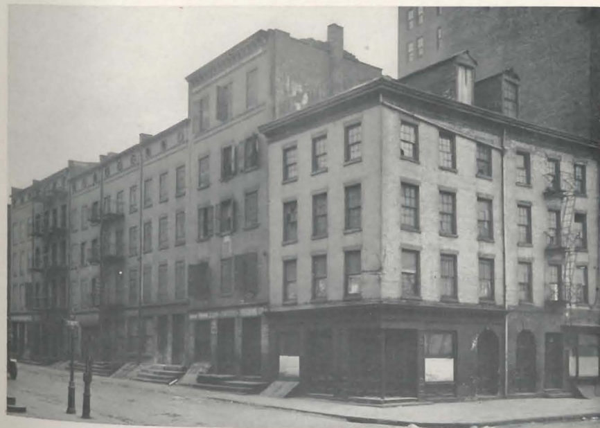
A view of the tenements and saloons which once occupied the site of the Institute's Annex Building at Front Street and Coenties Slip. When these were torn down in 1925 the Institute pioneered in slum-clearance by constructing a decent shore dwelling for merchant seamen.