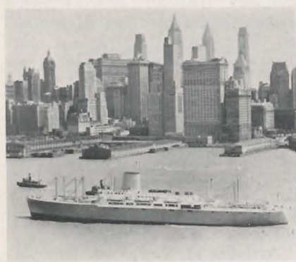
S.S. Panama, New Ship of the Panama Line

The officers and crew were assigned bedrooms on the ninth floor, and after they had had a good night's sleep they were anxious to see the sights of New York. They talked cheerfully of their experience, told of losing all their "gear" and belongings, and one cabin boy told of having purchased twelve pounds