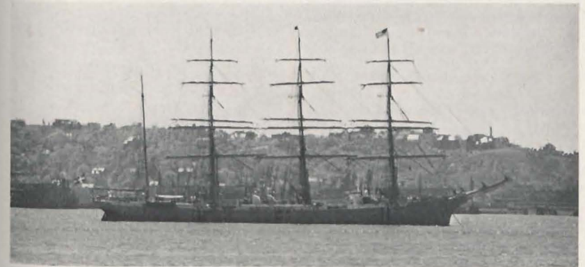
The "Abraham Rydberg" in New York Harbor, May, 1940

"I last saw this ship at San Francisco some twelve years ago as the "Star of Greenland" of the Alaska Packers fleet. The first time I saw her she was the "Hawaiian Isles" of Honolulu, flying the old Hawaiian flag. Part of 1896 and the major part of the year 1897, I was a member of the crew of this vessel, and from her decks saw several eventful happenings. At seven o'clock on a blustery morning in early April, 1897, while the "Hawaiian Isles" was discharging a coal cargo from Newcastle, N.S.W. at the Sugar Refinery, South San Francisco, I witnessed the capsizing of the British ship "Blairmore" in a squall. Anchored in Mission Bay, the "Blairmore", in ballast, was held partly