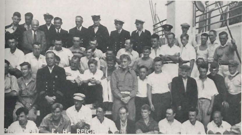
Officers and Crew of the "Matakana"