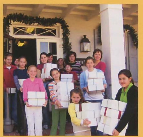
Members of the All Saints' Episcopal Church in River Ridge, LA packed homemade cookies, handmade children's cards, and other Christmas gifts for river mariners on December 11, 2005. They are part of SCI's River Friendly Church network.