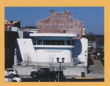
SEAMEN'S CHURCH INSTITUTE - PADUCAH CENTER

118 Export Street Port Newark, NJ 07114 Tel: 973-589-5828 Fax: 973-589-7463