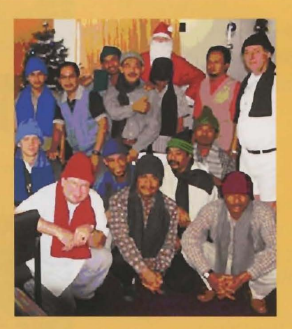
On Christmas Day 2005, the crew of the P/O Nedloyd Columbo wore their Christmasat-Sea gifts.