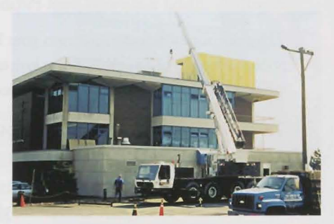
A work crew replaced all of the windows and placed new heating and air conditioning units on the roof as renovations continue at the International Seafarers' Center.

When completed, the renovated Center will offer updated and enhanced services to seafarers entering the port including an Internet lounge, zoned access accommodating increased operating hours, a dedicated volunteer area, and refurbished conference rooms. The last renovation to the Center was in 1989, 29 years after its opening in 1960.