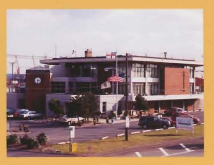
SEAMEN'S CHURCH INSTITUTE -PORT NEWARK CENTER

241 Water Street New York, NY 10038 Tel: 212-349-9090 Fax: 212-349-8342 sci@seamenschurch.org www.seamenschurch.org