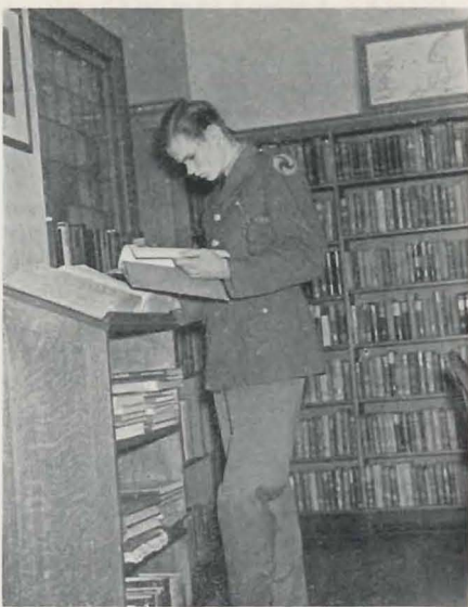
A Recruit in the U.S. Army Signal Corps Looks Up a New Word in the Dictionary in the Conrad Library.

ings of waterfront scenes. They patiently took turns reading the library's only copy of best-sellers like "Oliver Wiswell", "For Whom the Bell Tolls", etc. The Institute was glad thus to make its facilities available during the month's survey of air defense possibilities for this and nearby states.