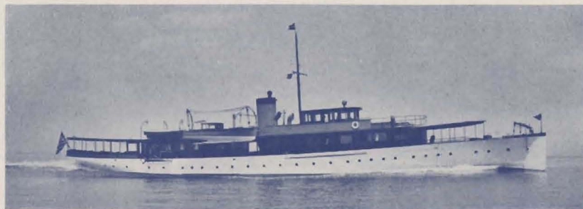
The Yacht "Colleen"

They liked to steer and practice And better seamen they will be When Uncle Sam says, "Get your packs And come along with me."