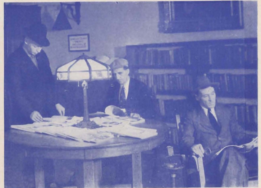
39,801 Books and Magazines Distributed

Some of the services rendered to worthy sailormen by the SEAMEN'S CHURCH INSTITUTE OF NEW YORK from January 1st to October 1st, 1932: