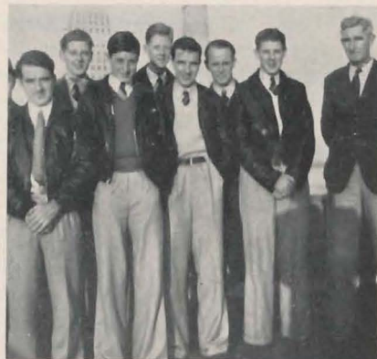
Crew of British freighter "ELMBANK"

* The 16 crews represent a total of 369 men of British, Belgian, Finnish, French, Norwegian, Nova Scotian and Dutch nationalities. Also during the past year the Institute was host to seven shipwrecked crews (natural causes rather than mines or torpedoes) representing an aggregate of 166 men. The average length of stay for these seamen was eight days.