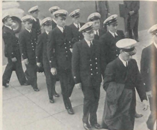
Merchant Seamen Students from Hoffman Island attend the Cathedral service on Sailors' Day