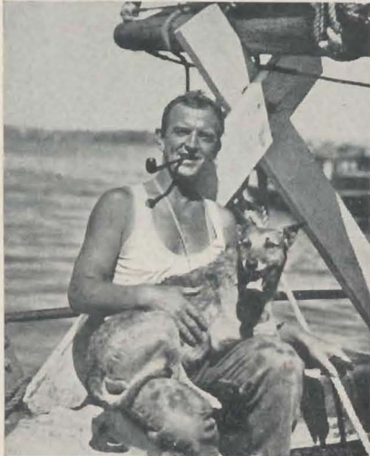
Two "Sea Dogs"

By WHITELAW REID By Telephone to the Herald Tribune Copyright, 1940, N. Y. Tribune, Inc.*