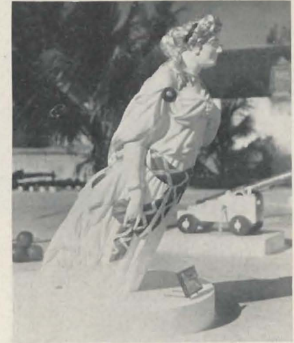
Figurehead of the "Caithness-Shire"