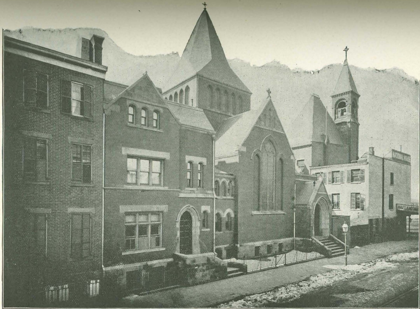
Rectory, 341 W. Houston St.