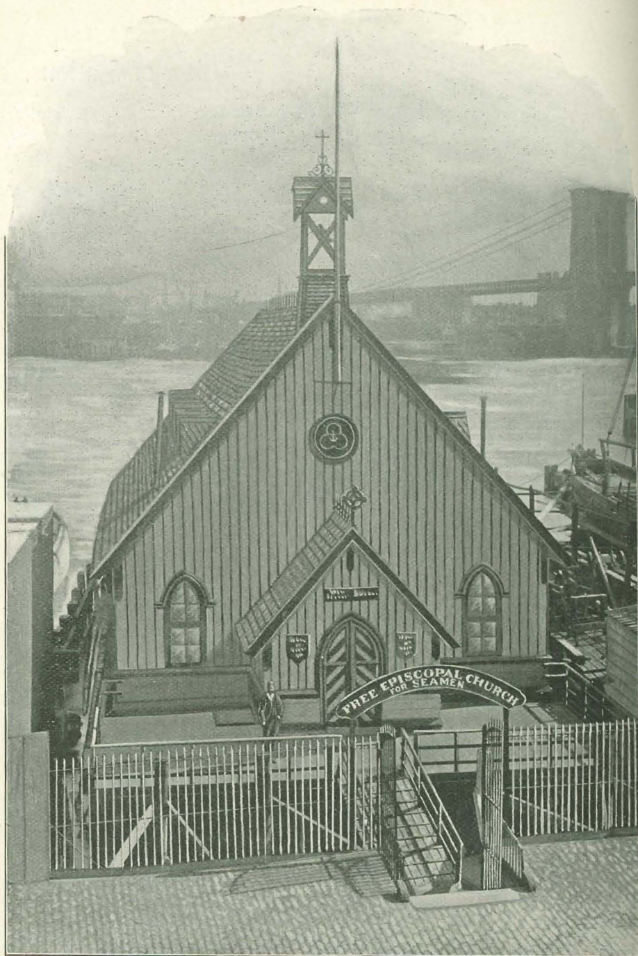
Floating Church of Our Saviour, Foot of Pike Street, E. R.